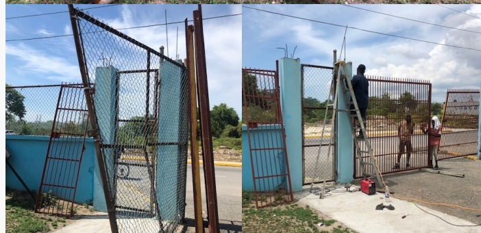
Removal and installation of new gates at CTR.